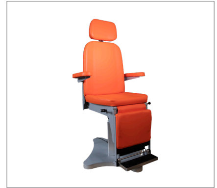
MEDITOP COMFORT CHAIR