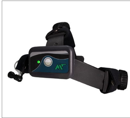
MEDITOP LED HEADLIGHT